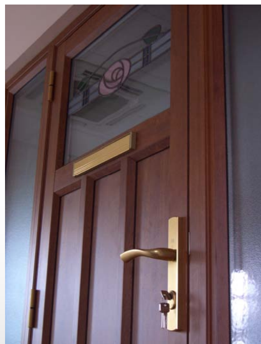
Installed Oak door with side screens

Rosewood—A deep ruddy wood with a rich sheen